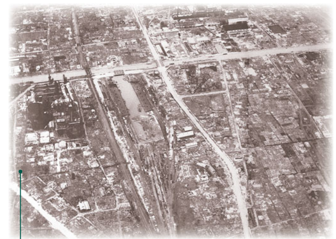
The Center of the Tokyo Raid and War Damages

Incorporated Foundation: Institute of Politics and Economy