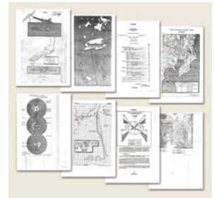
American strategic documents detailing the plans and results of the Tokyo air raid.