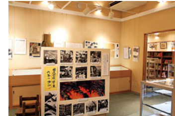
Wartime education and the student relocation program are the themes of the "Children and War" room.

A collection of incendiary bombs, victims' belongings, survivors' documents and photographs, and other war-related materials is housed in this room on the third floor.