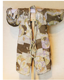
Child's fire-scarred kimono.