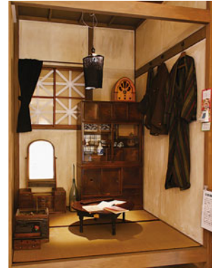
This room re-creates daily life during air raid blackouts.