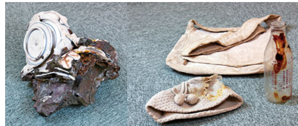
Left: Tile and dish melted together by intense heat Right: Shoulder bag, hat, and milk bottle of a child who was carried on its mother's back.

This room on the second floor is used for viewing video material and holding seminars with survivor speakers for reserved groups. The walls are covered with photographs, maps, and original works of art that all illustrate the horrors of the air raid.