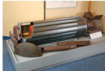
Actual size model of incendiary bomb clusters. Each weapon was designed to release thirty-eight smaller bombs before reaching the ground.